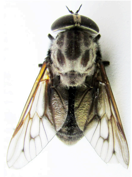
Figure 4. Tabanus subniger , Ontario (2015).