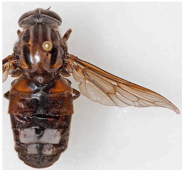
Figure 1. Merycomia whitneyi , New Brunswick.

Teskey (1990) recorded just one Canadian specimen from Erindale, Ontario. Thomas (2011) added one other specimen from the Credit River corridor. Stephanie Hill photographed a female (Fig. 3) on June 19, 2015 in Riverwood Park, Mississauga, in a riparian setting along the Credit River Valley corridor, and collected another female (Fig. 4) on June 20, 2016 at the same location. These are only the 3rd and 4th specimens known from Canada.