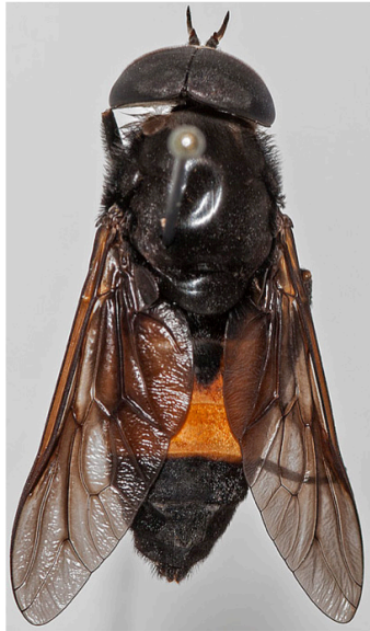
Figure 2. Hybomitra cincta , New Brunswick.