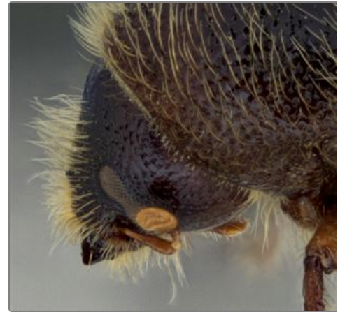
Ips pilifrons utahensis , female head, lateral

https://www.barkbeetles.info/regional_chklist_target_species.php?lookUp=1722