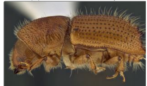
Ips pilifrons utahensis , female lateral habitus