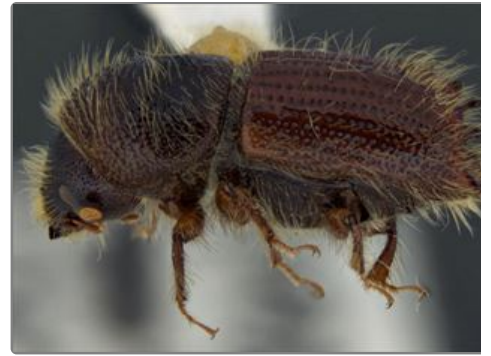
Ips pilifrons utahensis , male lateral habitus