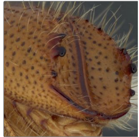
Ips pilifrons utahensis , female declivity