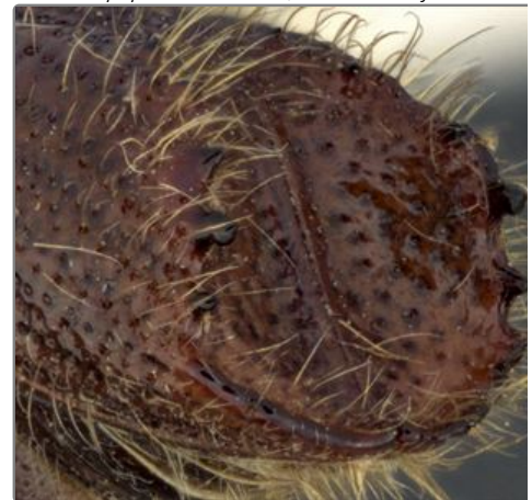
Ips pilifrons utahensis , male declivity