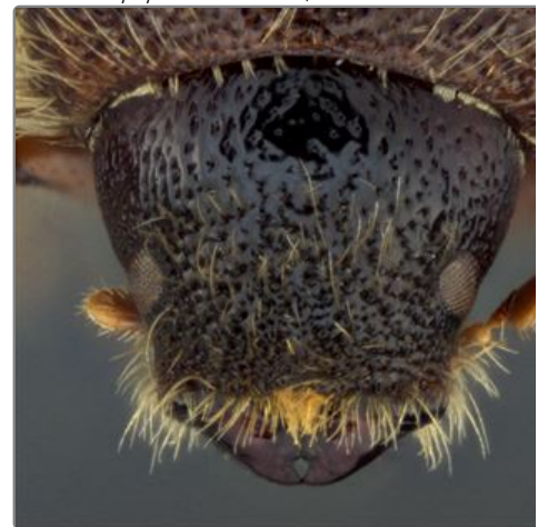
Ips pilifrons utahensis , male frons