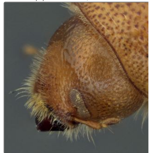
Ips pilifrons utahensis , female head, lateral