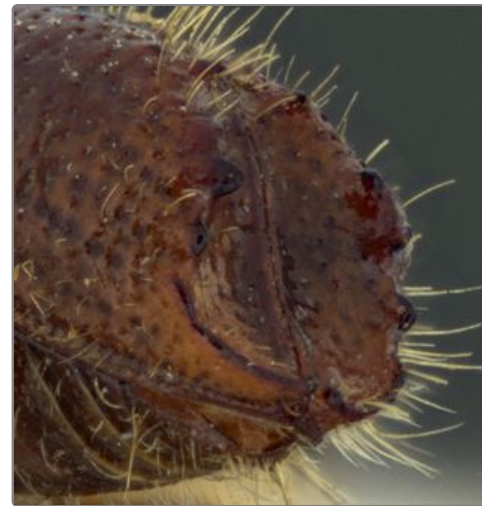
Ips borealis swainei , male declivity

Wood, S.L. 1982. The bark and ambrosia beetles of North and Central America (Coleoptera: Scolytidae), a taxonomic