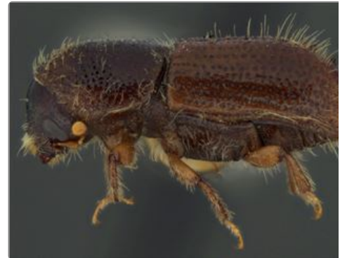
Ips borealis swainei , male lateral habitus