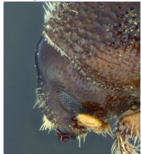
Ips borealis swainei , female head, lateral