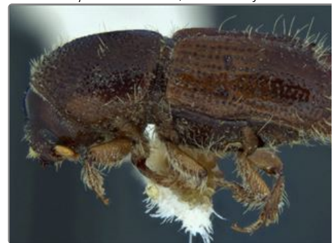
Ips borealis swainei , female lateral habitus